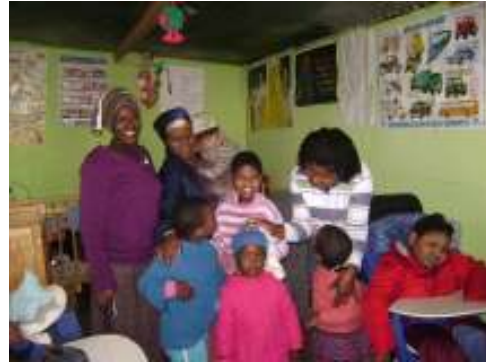
Some of the children at Yomelelani